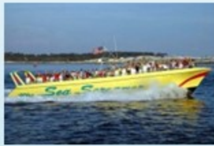
Fun boat rides